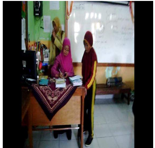
Doing the test