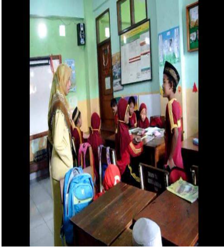
Students asked a question