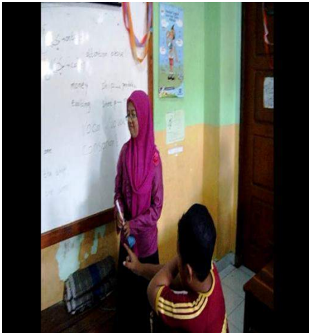
Presenting the material