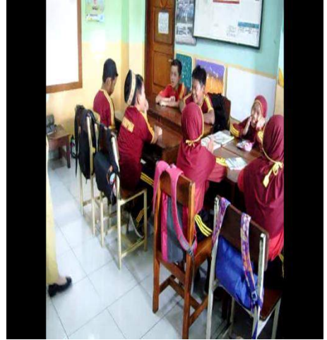
Students practiced in group