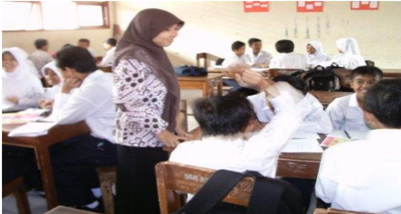
Students doing the task in a group