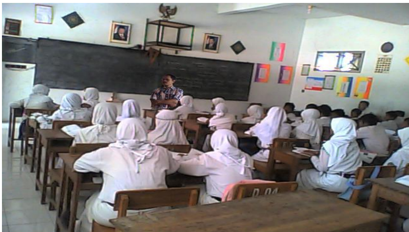
Students pay attention to the teacher