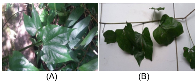
Figure 3. Leaf morphology of B. scandens from a plant found in the Pager Wunung Darupono Conservation Park (A); and a young shoot taken from the tree at the Sam Poo Kong temple, Central Java, Indonesia (B).

The leaves of B. scandens (Figure 2) are simple; ovate lamina, 50-90 mm in length and 40–80 mm in width, and are relatively thin. Both leaf surfaces are glabrous with seven to nine venations. The leaf margin is entire, the apex acuminate or caudate, and the base rounded to truncate or cordate.