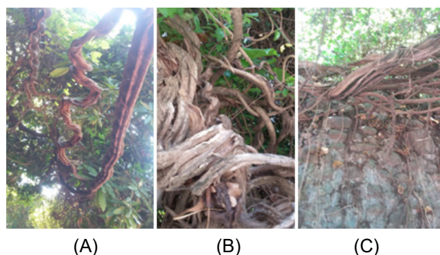
Figure 2. An old Pohon Rantai ( Bauhinia scandens ) tree found in Sam Poo Kong temple, Gedung Batu, Semarang, Central Java, Indonesia. The tree has a stem about 60-90 cm in diameter and a height of 25-35 m; it is climbing onto a mango and a kecacil tree. (A) Stems that have started forming chains; (B) basal stems of the tree; and (C) aerial roots at the base of the old tree that grew onto rocks.