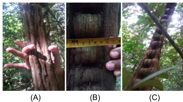
Figure 1. Pohon Rantai ( Bauhinia scandens ) found in the Pager Wunung Conservation Park, Central Java, Indonesia. The trees have stems about 15 -18 cm in diameter, with a height of 25 m, and they climb onto teak trees. Stems showing different aspects of development: (A) stems erect at the base; (B) stems with diameters of 15-18 cm; (C) fully developed stem that has formed chains.