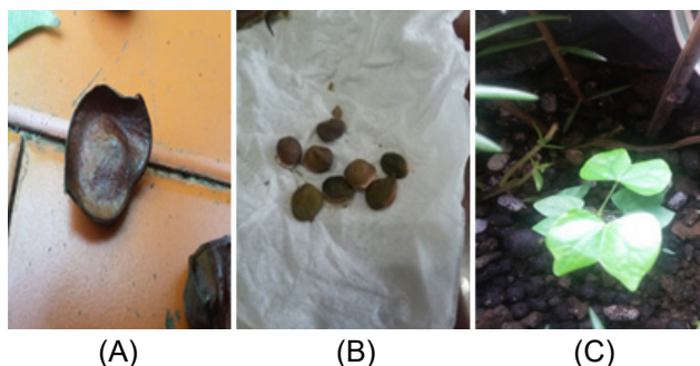
Figure 5. B. scandens fruit (A), seeds (B), and a four-week-old seedling with five true leaves (C). Seeds were sampled from a tree growing in the Pager Wunung Conservation Park, Central Java, Indonesia.

The fruit of B. scandens (Figure 5A) are brown in colour and pea shaped. The fruit pod is 1.8-3 cm long and 1-1.6 cm wide (Figure 5A). The pods contain one or two ellipsoid to obovoid seeds about 8 mm long (Figure 5B). The plants in the Conservation Park flower in the period August to October, with the fruit maturing in October.