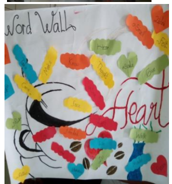
(Students making wordwall)