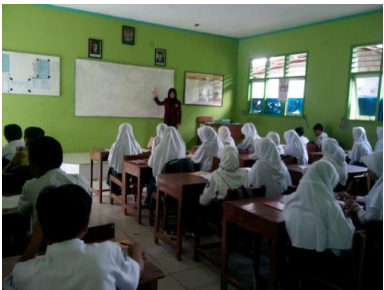
(Teacher explains the material)