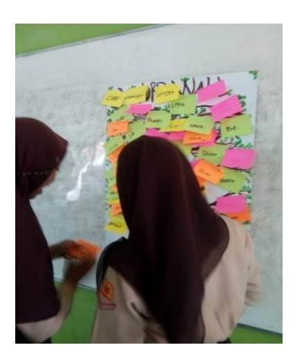
(Students presenting their work)