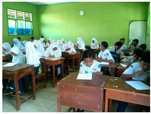
(Students work on pre test)