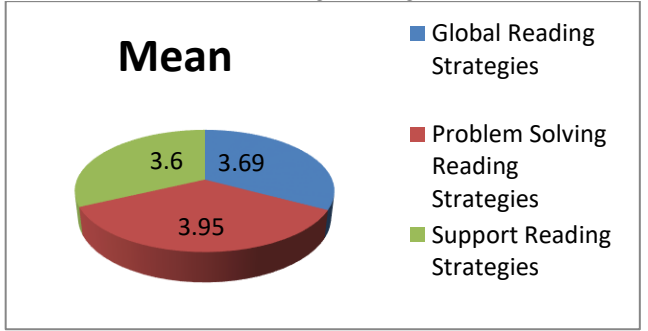
Chart 1.1 The Comparison of Three Metacognitive Online Reading Strategies

The chart above shows the illustration of students' metacognitive online reading strategies awareness in comprehending the text. The chart shows us that the students' level of problem-solving reading strategies is the highest strategies used by the students, with the total mean score 3.95. Then the next type of strategy that usualy used by the students was global