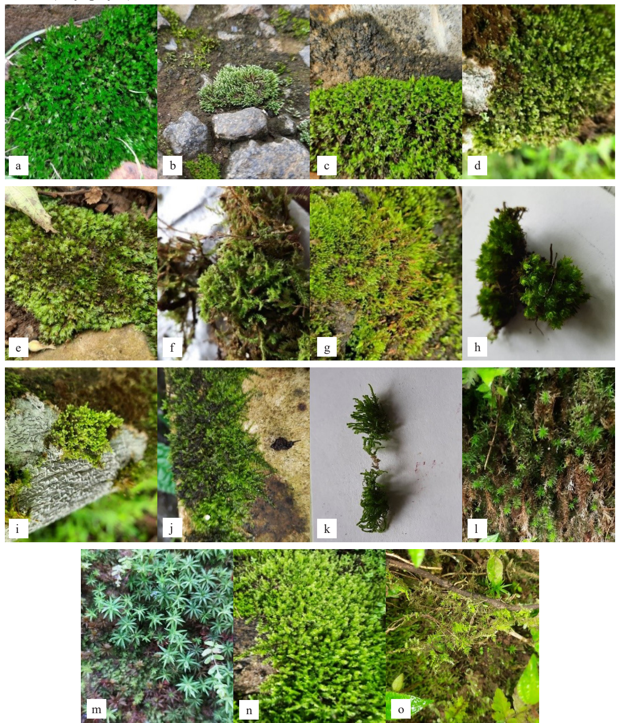
Figure 3. Mosses found at Mt. Prau, Blumah Village. a. Brachymenium indicum, b. Bryum argenteum, c. Calymperes tenerum, d. Ectropothecium falciforme, e. Fissidens atroviridis, f. Fontinalis antipyretica, g. Hyophila apiculata, h. Hyophila javanica, i. Hypnum cupressiforme, j. Isopterygium minutirameum, k. Philonotis hastata, l. Polytrichum commune, m. Polytrichum strictum, n. Rhynchostegiella sp., o. Thuidium tamariscinum