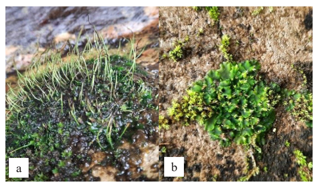
Figure 5. Hornworts found at Mt. Prau, Blumah Village. a. Anthoceros sp., b. Notothylas javanicus

Figure 5 shows the morphology of two hornworts found at Blumah Village. According to Lukitasari (2018), hornworts always have a horn-shaped sporophyte structure, with embedded sexual organs. Having the structure of the thallus, especially its internal anatomy and cell contents, is an observable important for classification. Likewise, the sporophyte (which contains sporangial walls, spores and their ornamentation, and sterile cells mixed with spores) and sterile cylindrical structures (if any) in the sporangium.