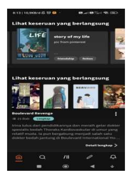
Figure 2.2 Wattpad App Features

From Figure 2.1 above it can be seen that the Wattpad application has several features, namely the homepage feature where there are several recommended stories and the most popular stories, then there is a search feature where we can search for stories based on genre and hashtag, then there is a library feature where we can grouping stories that we will read without using an internet data connection, then there is a notification feature where if the author updates the story he wrote it will go to user notifications, and the last is the profile feature of other users' works, Wattpad also provides a