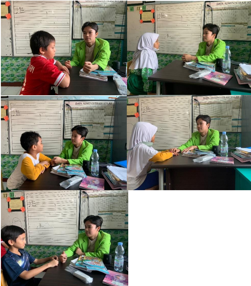
Interview with third graders about their opinions on learning to use English songs