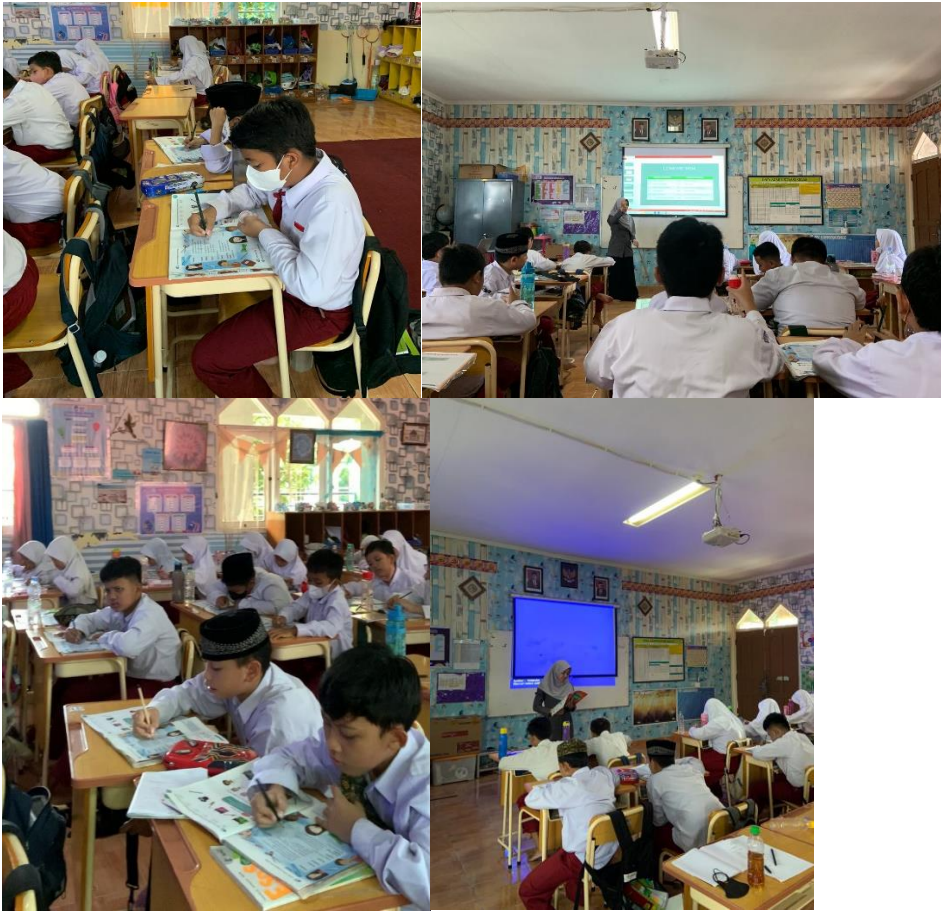
Observation in grade 4 Dzul kifli with Miss Uut who teaches English using songs