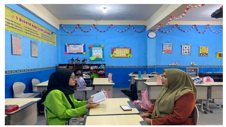
Figure 1.3 The researcher asked teacher's about the disadvantages and advantages of implementing IBL in EFL classes.

Those are the results of interviews conducted by researchers. From this interview,, the teachers gave their opinions and experiences on implementing IBL in the EFL classroom. With a variety of opinions ranging from analyzing students' character, giving them freedom in lessons, and preparing a mature plan for the process during classroom teaching. The teachers also hope that teachers who will use IBL in the futurecan implement it well and successfully, of course.