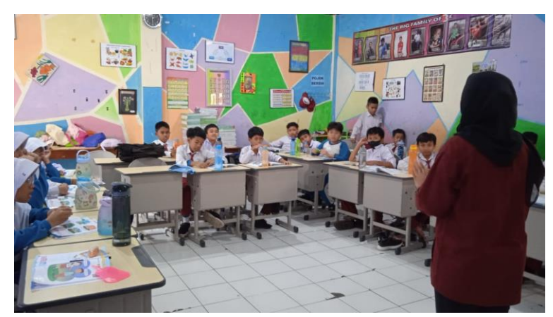
Figure 1.1 The teachers implementing IBL in EFL classrooms

group, there are students who have fast grasping power and students who have slow grasping power. This is so that students with fast grasping power can help those with slow grasping power. So that the rights obtained by each student are equal and fair." (RT2)