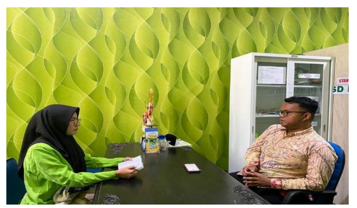
Figure 1.4 The researcher asked teacher's about the disadvantages and advantages of implementing IBL in EFL classes.

Teachers argue that the disadvantage of implementing IBL in EFL classrooms is that students have less capacity to catch up, so teachers have to make more efforts by making different teaching strategies for each student so that students get the same lessons and other students leave no one behind.