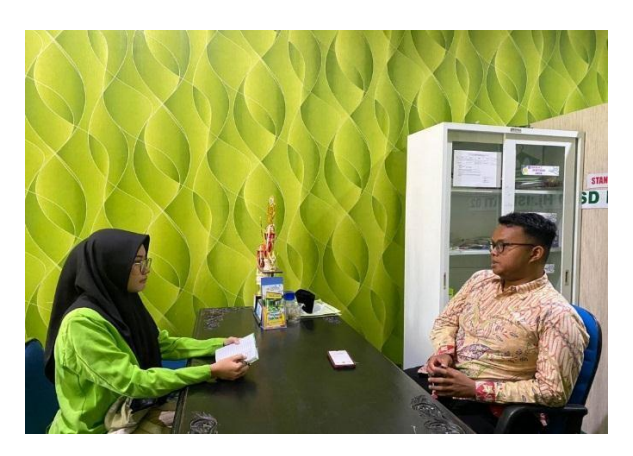
Figure 1.4 The researcher conducted interviews with male teacher