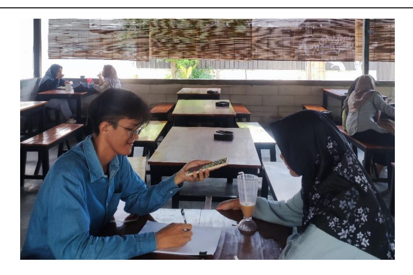
Figure 3. The documentation of the interview with Pre-Service English Teacher Three (PT3)