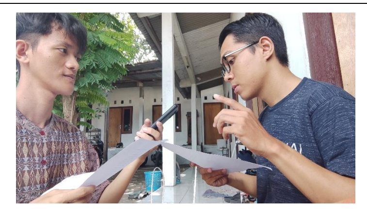
Figure 2. The documentation of the interview with Pre-Service English Teacher Two (PT2)