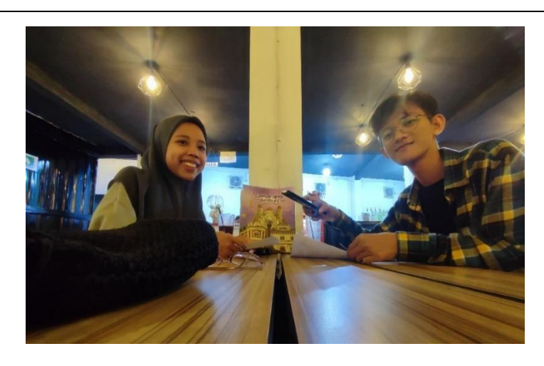
Figure 1. The documentation of the interview with Pre-Service English Teacher One (PT1)