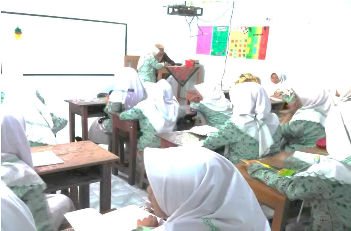
Post test in control class