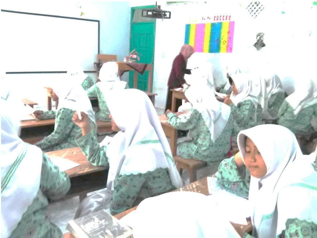
Minimal pair test in expeerimental class