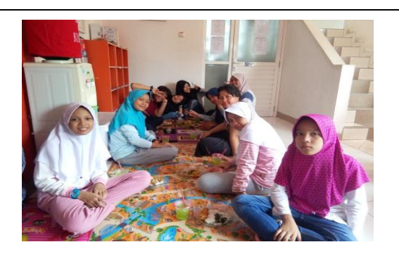
Eating Time for Girls