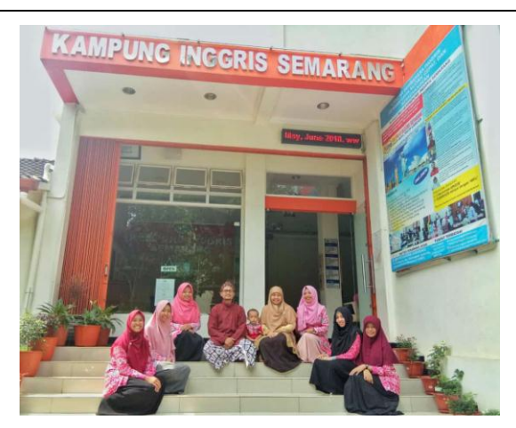
Teachers with the Director of KING