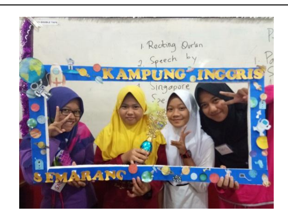
Star Room (Cleanest room of the day)