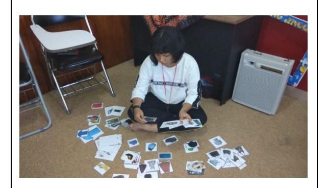
Some students as seller