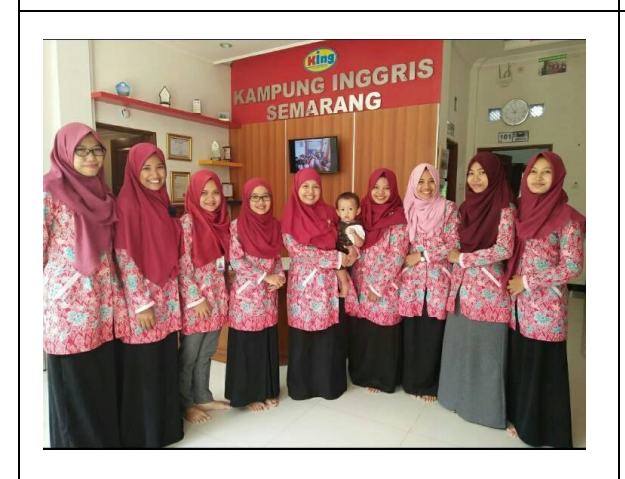
Teachers and Stuffs