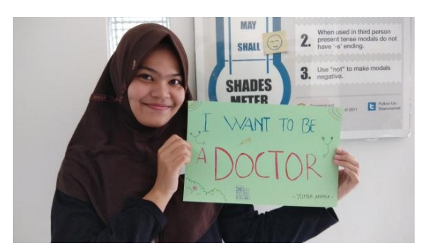
Write a Dream Job