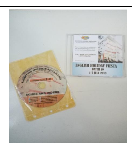
CD (Listening Conversation, Photo & Video)