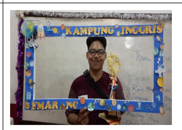
Super Students of the day