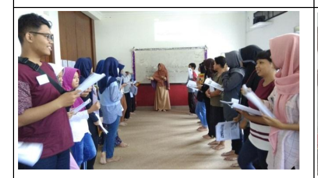
Communicative Method Make two line and practice a conversation