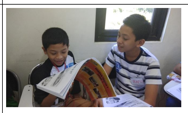
Practice the listening conversation with partner