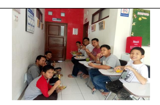
Eating Time for Boys