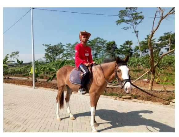
Riding a Horse