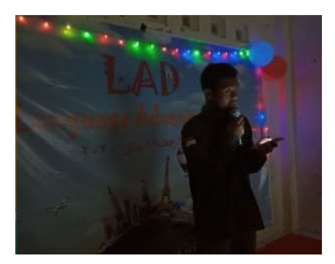
(English Poetry, Language Adventure Day)