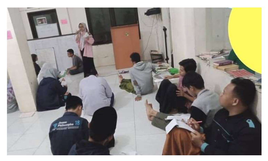
(Tutor gave some vocabularies)