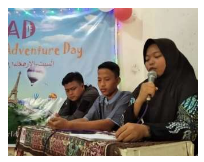
(English Debate Competition)