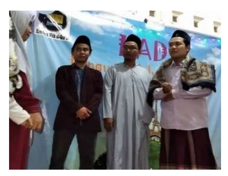
(Qur'anic English Theater, Language Adventure Day)