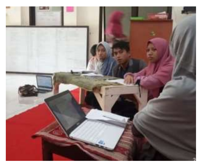
(English Debate Competition)