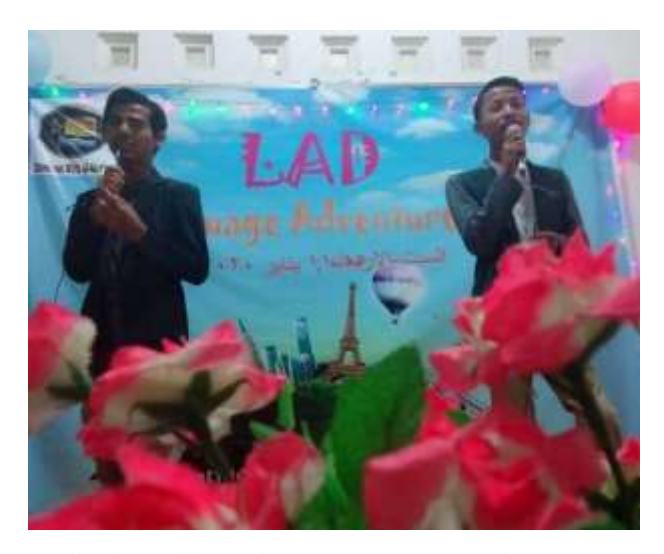
(Singing Bilingual Song, Language Adventure Day)