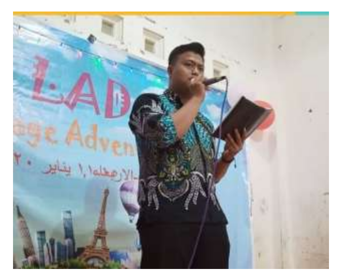
(Storytelling, Language Adventure Day)