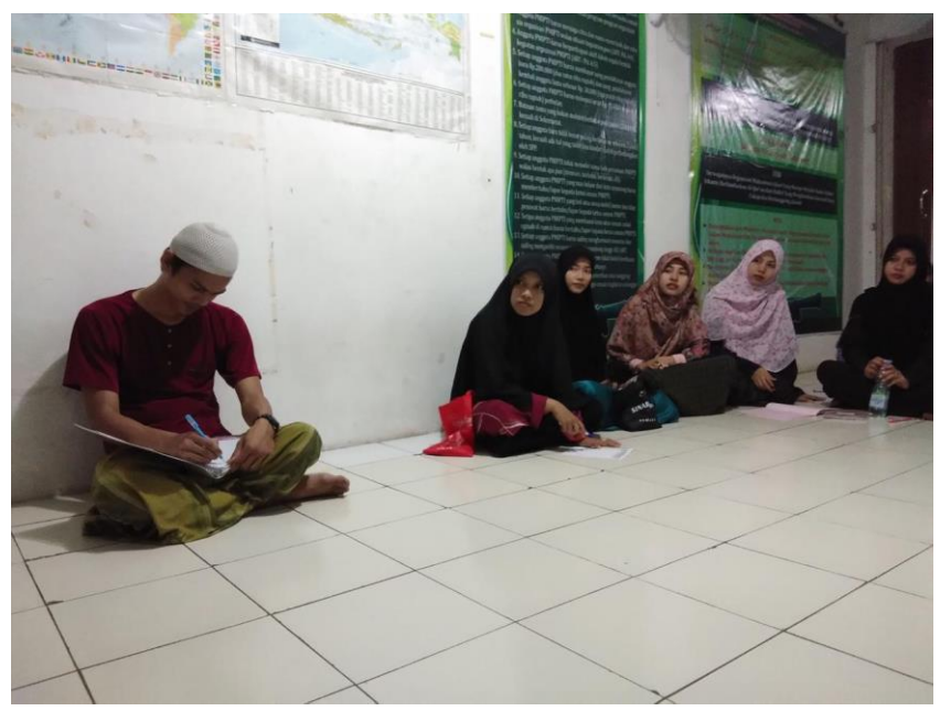
The Researcher Conducts the Questionnaire