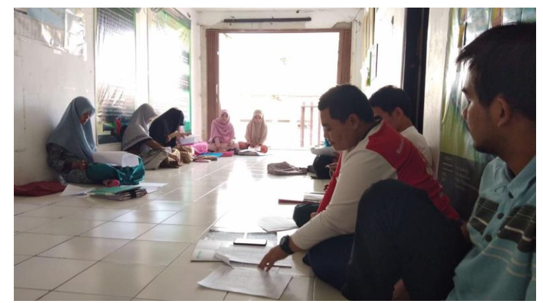
The Thai Students Flling the Questionnaire