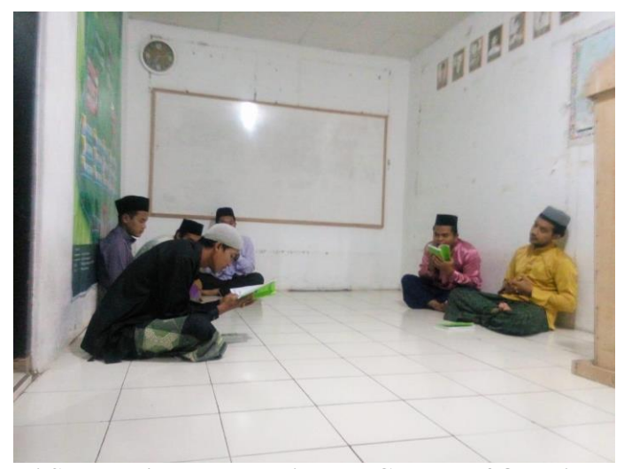
The Thai Students' Understanding the Content of Questionnaire