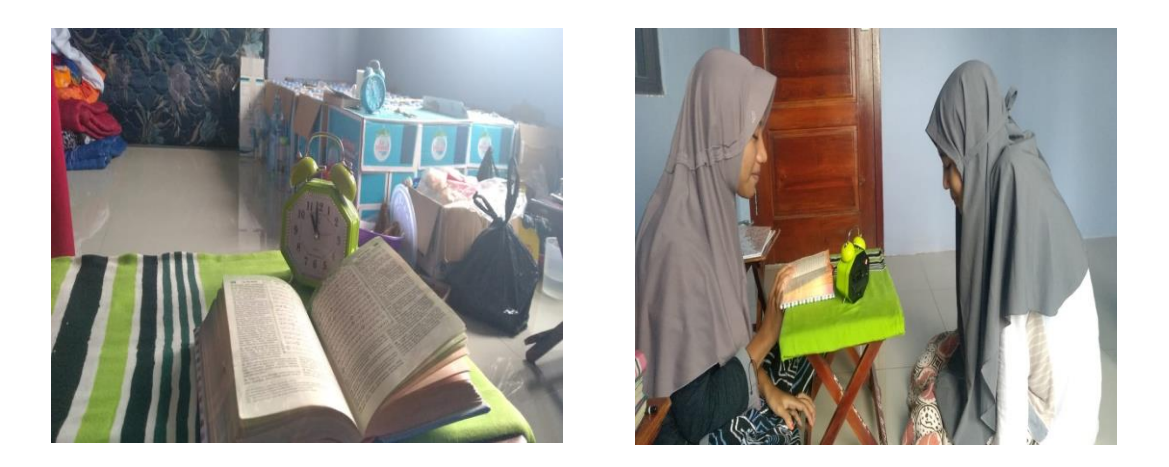
The second type of riy\bar{a}dah qur'an tradition One day one juz mandatory deposit as long as the second type of riy\bar{a}dah qur'an tradition