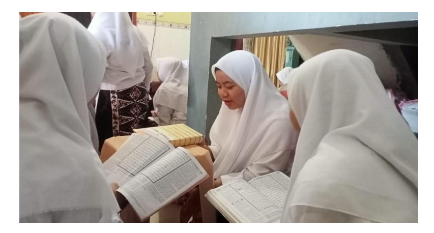
Muroja'ah activities together