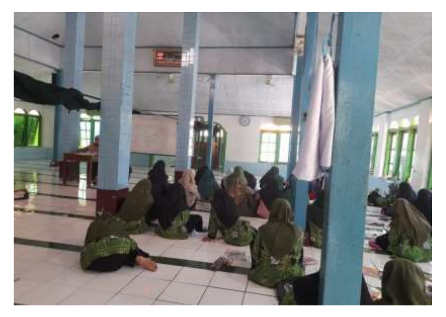
\label{eq:picture 10.1} Picture \ 10.1 \\ 7^{th} \ grade \ teaching \ and \ learning \ activities