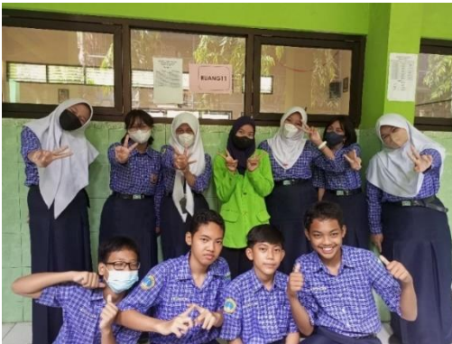
Picture 1.11 photo with all participants