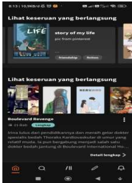
Figure 2.2 Wattpad App Features

From Figure 2.1 above it can be seen that the Wattpad application has several features, namely the homepage feature where there are several recommended stories and the most popular stories, then there is a search feature where we can search for stories based on genre and hashtag, then there is a library feature where we can grouping stories that we will read without using an internet data connection, then there is a notification feature where if the author updates the story he wrote it will go to user notifications, and the last is the profile feature of other users' works, Wattpad also provides a