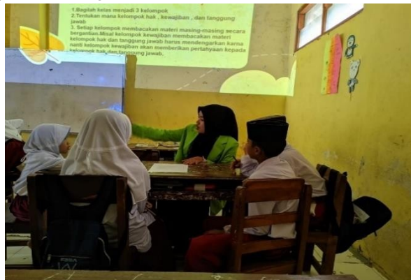
Figure 1. Class Atmosphere Using the Team Quiz Model Combined Word Wall Game

cannot answer, then they will get a penalty, namely answering the questions given by the teacher through the word wall game media which is presented on the projector screen. Then learning will be more effective and active.