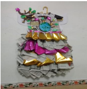
Gambar 5 : Kostum bahan bekas