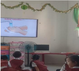
Gambar 3 : Lagu ayo cuci tangan