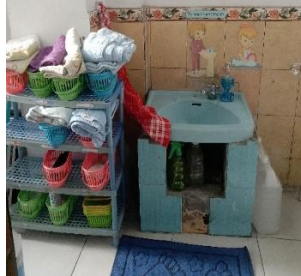
Gambar 2 : Fasilitas kebersihan