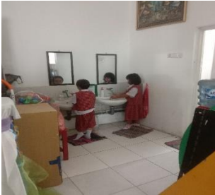
Gambar 1 : Anak mencuci tangan