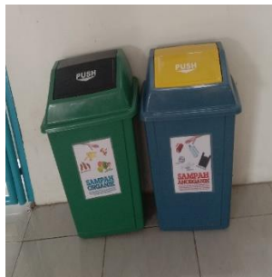
Gambar 6 : Tong sampah