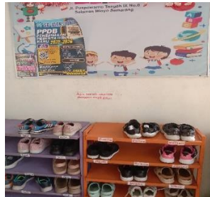
Gambar 4 : Rak sepatu anak