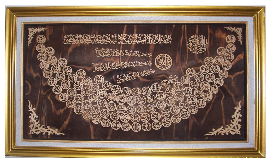
Asmaul Husna in Thuluth style