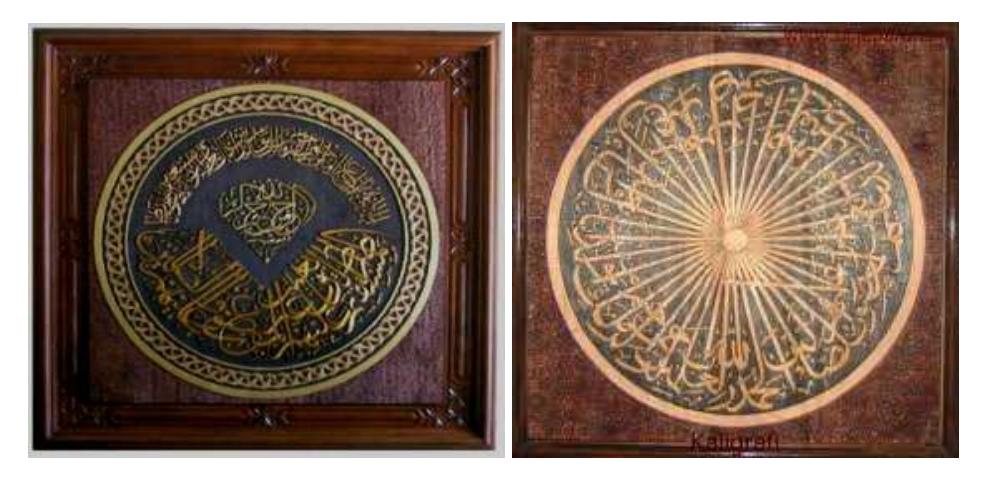
Surah al Fatihah in Thuluth and Naskh style