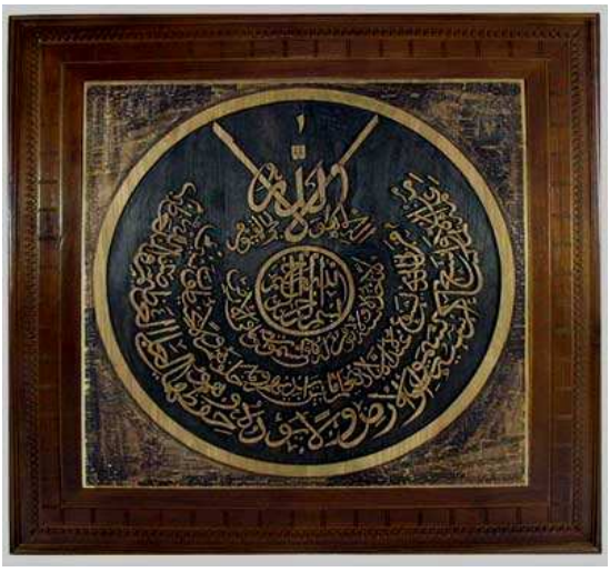
Ayat Kursi in Thuluth style