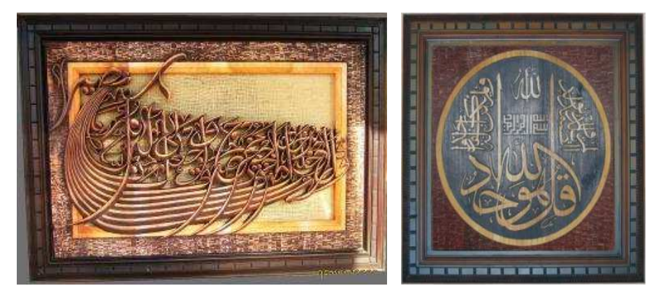
Surah Al Ikhlash in Khufi and Thuluth style.