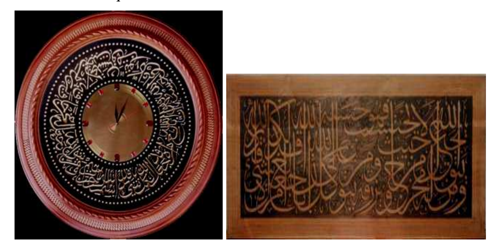
"Whoever is careful of (his duty to) Allah, He will make for him an outlet, and give him sustenance from whence he thinks not (65:2-3)" in Thuluth.