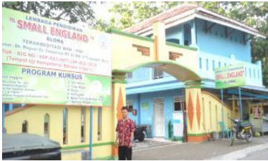
The location of Small England (Centre) in Tunjungan, Blora