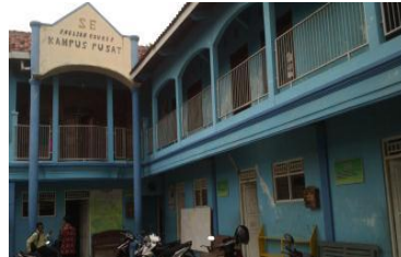
The location of SE from front