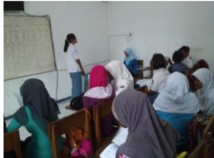
A student is memorizing