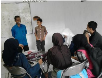
A student is reporting in discussion