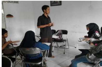
Students are having discussion group