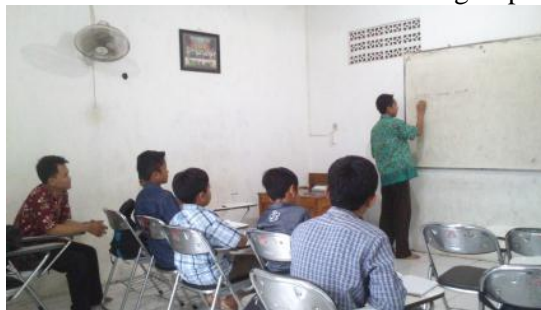
A teacher is giving new material