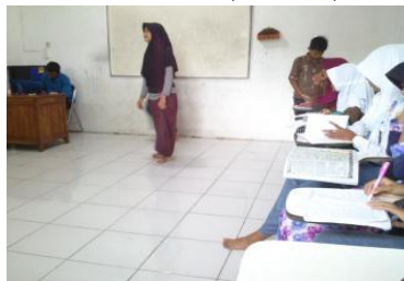
A student is delivering speech