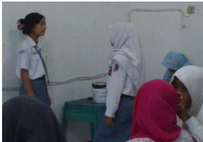
The students are chatting in pair