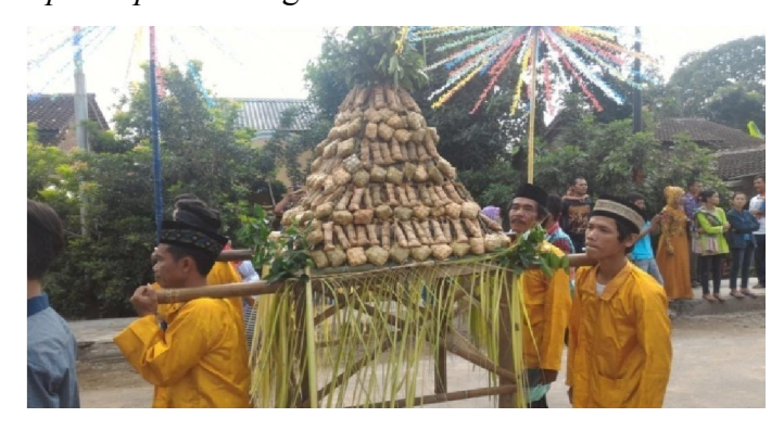
12) Sego Golong offerings carrier