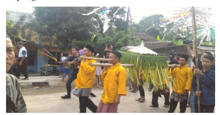
9) Fruit offerings carrier