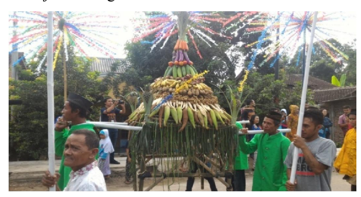
11) Kupat Lepet offerings carrier