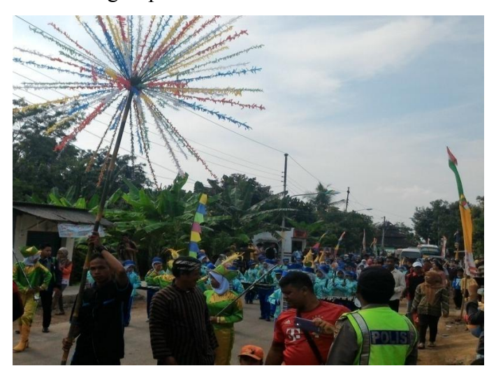
14) Civil society