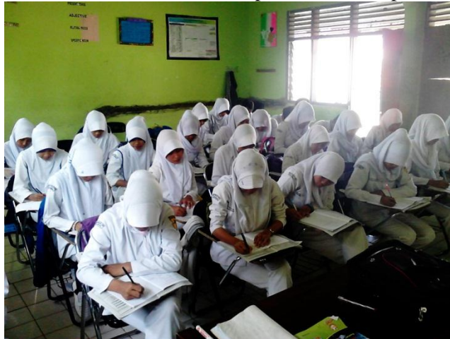
Picture 2. Explaining the Material