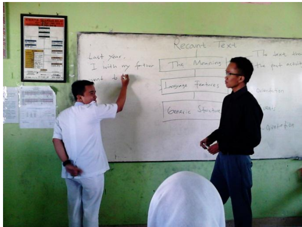
Picture 4. Activity in Control Group