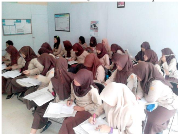
Picture 6. Exercise in Control Group